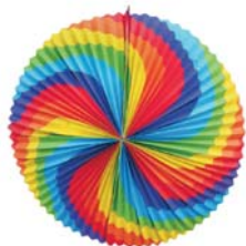
Lantern round RAINBOW (PAP) Ø 34 cm 66864 120 x 1 pcs (6 x 20 pkg)