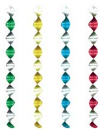
Foil spiral (ALU) Ø 7,5 x 60 cm 66818 200 x 4 pcs (10 x 20 pkg)