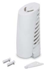
Air freshener, white (ABS) 60871 6 x 1 pcs

Requires 2 AA Alkaline batteries - not included 2 x 1,5 V