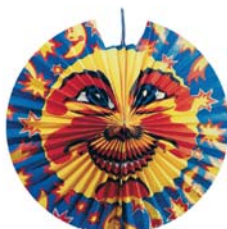
Triangle lantern SUN AND STARS (PAP) Ø 45 cm 66868 120 x 1 pcs (6 x 20 pkg)